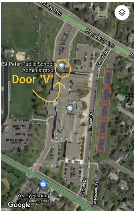
St. Peter Middle School 2nd Floor

Students will be dropped off and picked up at Door "V" (fig. a) of the St. Peter Middle School off of Broadway Ave. It is recommended that students arrive 5-10 minutes before their scheduled time and are picked up promptly at their scheduled end time. When arriving students will either take the stairs or elevator to the east wing of the first floor (fig. b and fig. c). The PAES lab is at the end of the hallway in room #124.