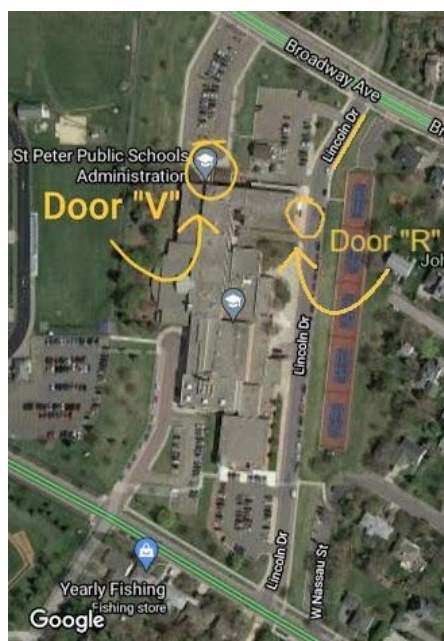
St. Peter Middle School 2nd Floor